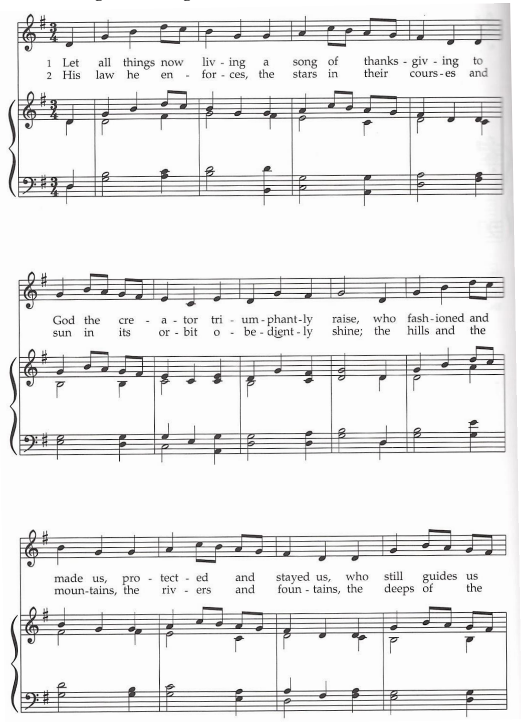
HYMN • Let all things now living